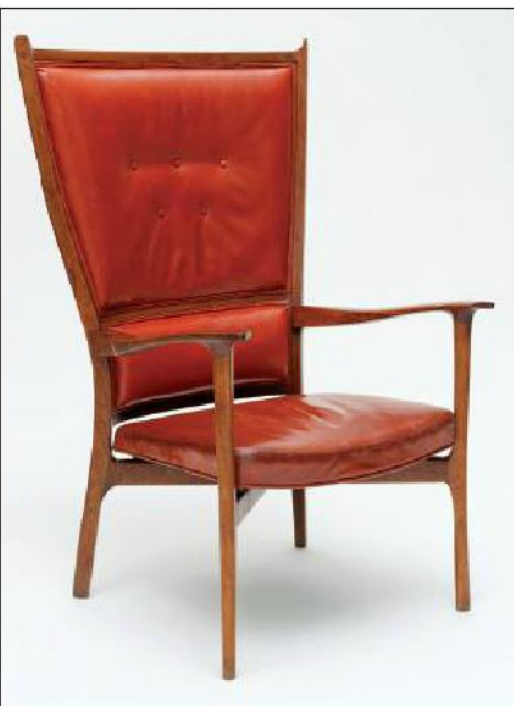
John Kapel Chair (c. 1958) Walnut, leather (46 3/4" h, 30 1/2" w, 26 1/2" d)

The LACMA exhibit runs thru Mar. 25 and is documented in a 360-page catalogue, with a variety of essays by leading architecture and design historians. In addition, an all-day program on The Legacy of the California Design Exhibitions: Creating a Forum for Craft and Design is being held on Nov. 12. For info, visit the website, www.lacma.org or call: (323) 857-6000.