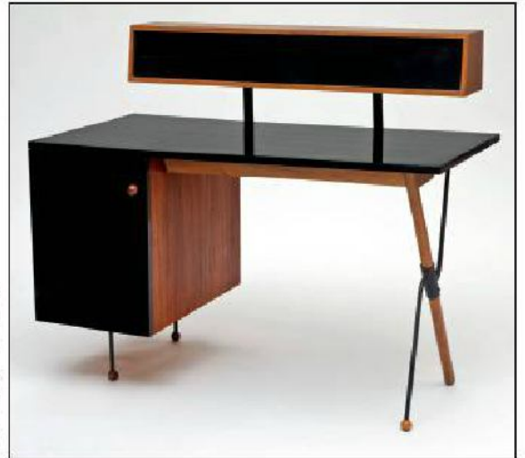
Greta Magnusson Grossman Desk (c. 1952) Walnut, Iron, formica (47 5/8" h, 23 3/4" w, 40" d)

It is Pacific Standard Time in Southern California. This refers not only to the annual time change, but to the extraordinary arts festival taking place across the region. Over 60 art and cultural organizations, in addition to various galleries, are cooperating in celebrating the spectrum of creativity that emerged during the post-World War II era in this region and helped shape the culture of the entire country.