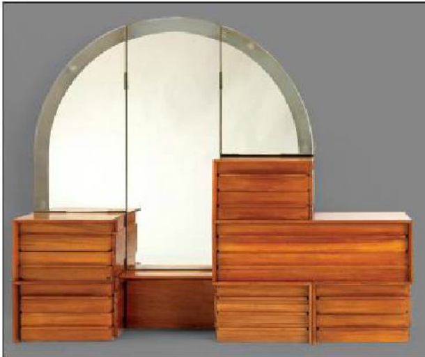
R.M. Schindler Dresser with Mirror ( Shep Commission, 1935 ) Gumwood, mirror (70 1/2" h, 105" w, 26 3/8" d)