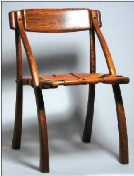
Arthur Espenet Carpenter Wishbone Chair (1972) Shedua wood, leather strapping (31 1/4" h, 22" w, 22 1/2" d)